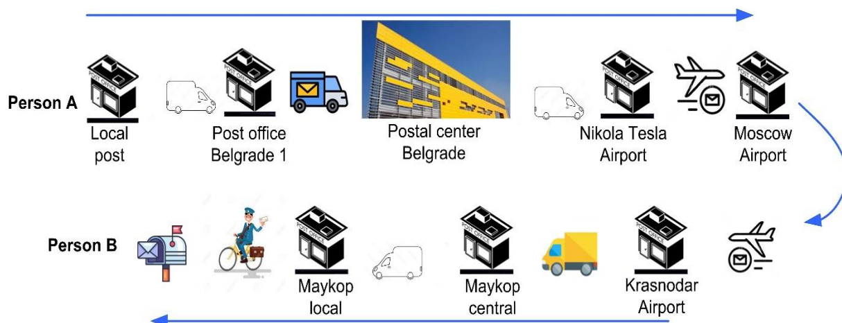
Fig. 1 An example of a city logistics problem. Person A sends a letter to Person B

The environment dictates many constraints that a carrier must deal with to meet the demands of urban customers and business partners. At the same time, carriers must find new innovative solutions, which are often ad hoc solutions. This was also the case at the beginning of the COVID-19 pandemic when customers suddenly changed their previous habits. Home delivery has become a significant and even dominant way of selling. Retailers had to adapt quickly, and transporters faced major challenges. Many small vehicles had to be provided to transport small quantities of goods. Bicycles have become a significant factor in transportation. Such a rapid change brought, in addition to a change in the way of transporting goods, a change in the way of paying for delivered goods and charging for services rendered.