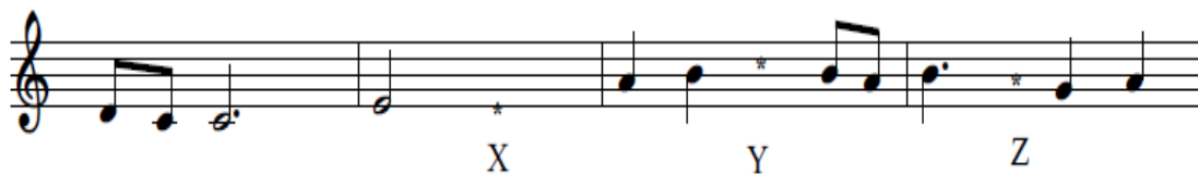
Fig.1.A task from the initiative Music equations.

discussions between the team members – the first level of control. A kind of self-control was done when the students compared the 'official' solutions with their own ones.