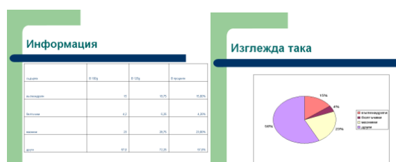
Fig. 4. Proceeding the data for the initiative Math that surrounds us .

This was the first project-oriented initiative held in St. George School where a processing matrix was put in practice. We designed it to technologize the entire process of planning, providing and performing the initiative goals, activities and results.