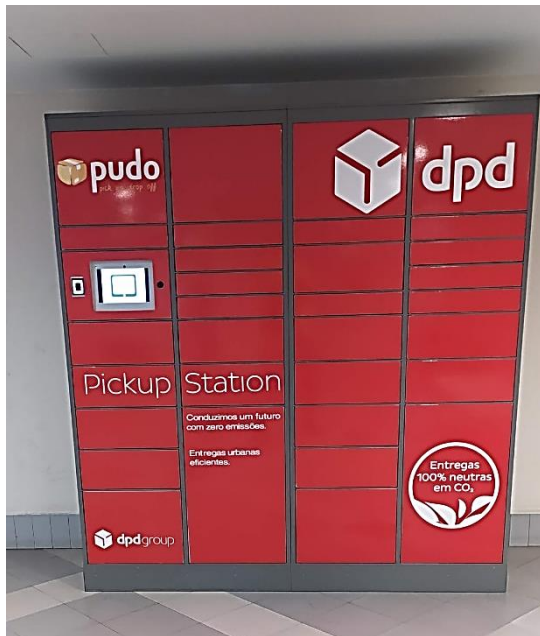
Fig. 2 An example of smart cabinets in Portugal

These and other innovative solutions are discussed in more detail in (Čekerevac, Bogovac, & Radovanović, Some Solutions to Overcome Challenges Faced by Last-Mile Delivery in Smart Cities, 2023)